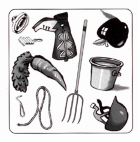
ANSWER: HOOF PICK, PAIL AND HELMET.

Make reading a pleasurable and relaxing time for you and your family. Don't force your child to read. Reading is a skill every child develops. Your child may not be ready. Work to inspire your child with imaginative and unstructured play. Play is how children learn.